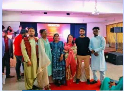
cultural team from foreign participants

The Rotaractors of RI 3181 come from our different zones namely Kanara Kaveri Chamundi and participated in the various categories. Renowned artists and performers from the fields of Singing Dance and Fashion world were there. The participants enthralled us with great performances and thought provoking acts.